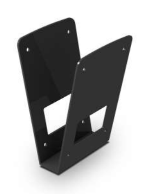
MASKCV-BL V-shaped 2-way cluster bracket for MASK4C(T)-BL/MASK6C (T)-BL