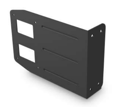
MASKCL-BL L-shaped side bracket for MASK4C(T)-BL / MASK6C(T)-BL